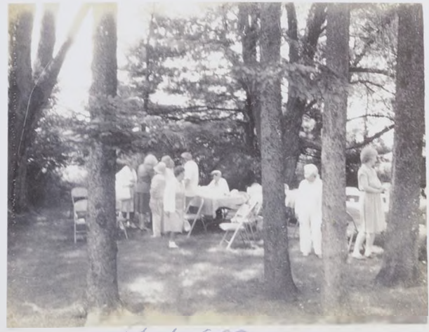
July 9, 83