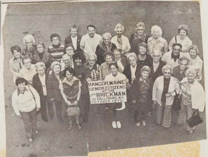
We Had A Ball

The referendum question dealing with the Maine Yankee atomic power plant will be the topic when the Senior Citizens Friendship Club of the Jewish Community Center holds its monthly meeting at 2 p.m. Tuesday, Oct. 13, at the Jewish Community Center on Somerset Street in Bangor. Oct 13, 1987