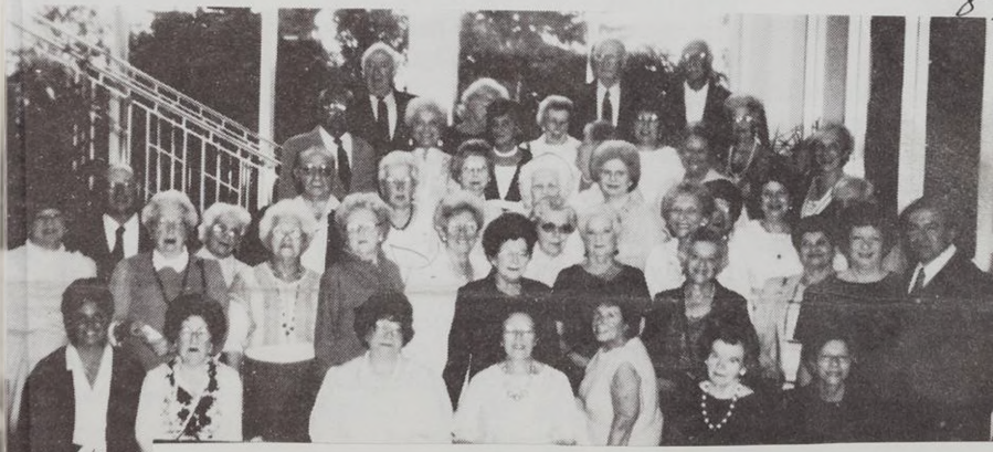
SHOWN ABOVE are the JCC senior citizens and friends from Bangor, Augusta, Waterville, Portland, New York, Presque Isle and even Florida who experienced a great week at the Pines Hotel in the mountains. Next year's trip is to a different hotel and reservations have already been made.