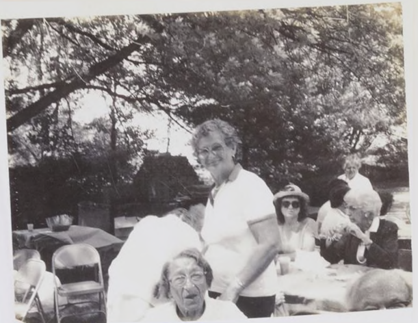
July 9, 83