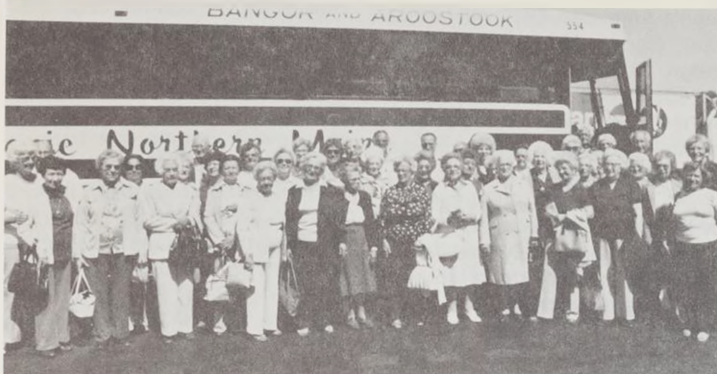
The Senior Citizen's Friendship Club of the Jewish Community Center is planning their Annual Trip to the Catskill Mountains. This year it is the Stevensville Country Club on October 2nd through 5th. Reservations are a must by April 14th. Pictured are the group returning from the trip last year.