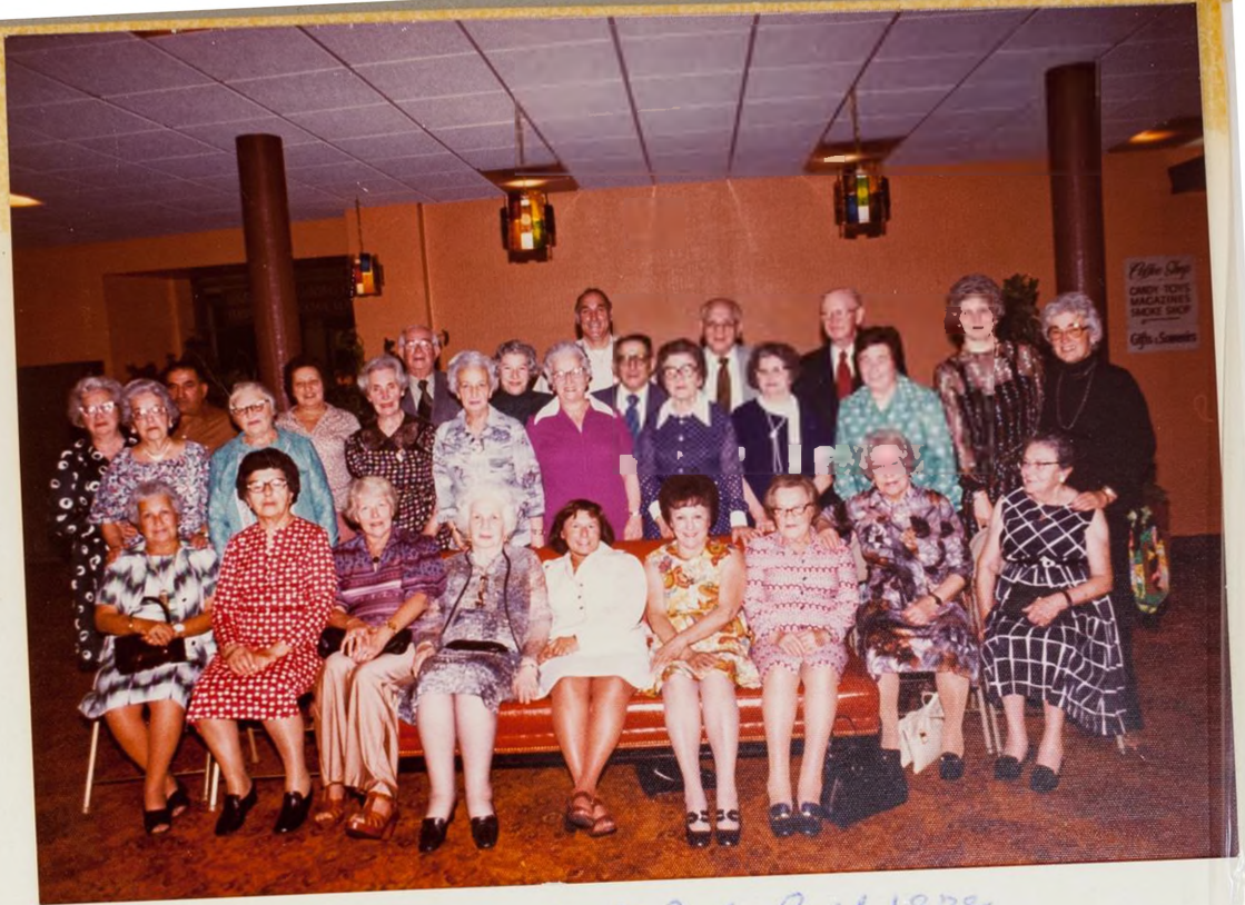
The Pines Hotel - Catskill Mts, N.Y. Sept 1978