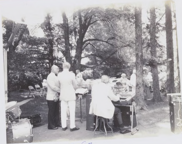
July 9, 83