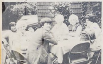
"Please, no dessert, I've had enough goodies!" Summer 1981