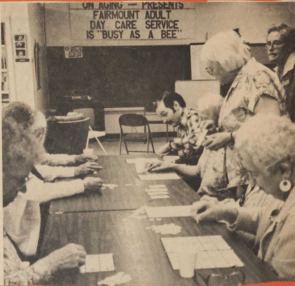
Busy program members

Fairmount Adult Day Care Services is a program of the Eastern Area Agency on Aging.